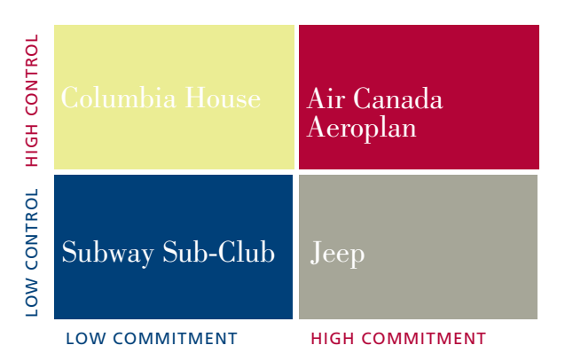
FIGURE 1 Commitment & Control Based CRM Programs

As the basis for CRM programs, commitment and control should not be regarded as mutually exclusive variables. Some CRM programs may be based entirely on the development of trust and customer commitment while other CRM programs will be entirely based on control, primarily serving the firm rather than customers. However, the reality of CRM programs is that many will contain some elements that are indicative of both commitment and control-based mechanisms. It is also possible that some CRM efforts could be weak and ineffective because they are based in neither commitment nor control based mechanisms. Figure 1 presents some exemplar CRM programs that are based on the various combinations of commitment and control orientations (Subway Sub-Club, Columbia House Club, Air Canada Aeroplan, Jeep Jamboree). These exemplar programs will now be discussed in some detail.