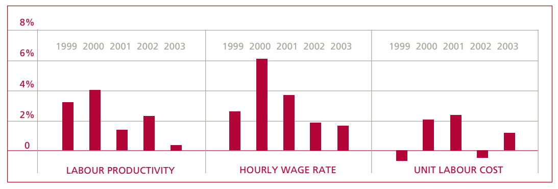
FIGURE 2. LABOUR PRODUCTIVITY, HOURLY COMPENSATION AND UNIT LABOUR COST IN CANADA

Source: Chart prepared by the author based on statistics reported in "U.S. Pulls ahead in Productivity" The Globe and Mail , 15 February, 2001, B-3