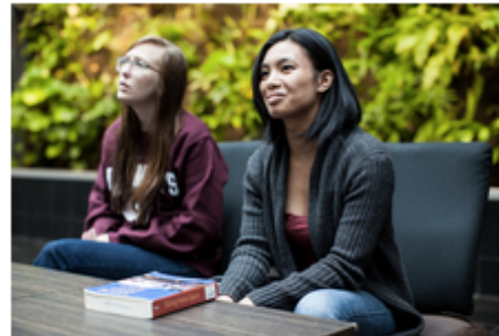
The Value and Values of Saint Mary's University