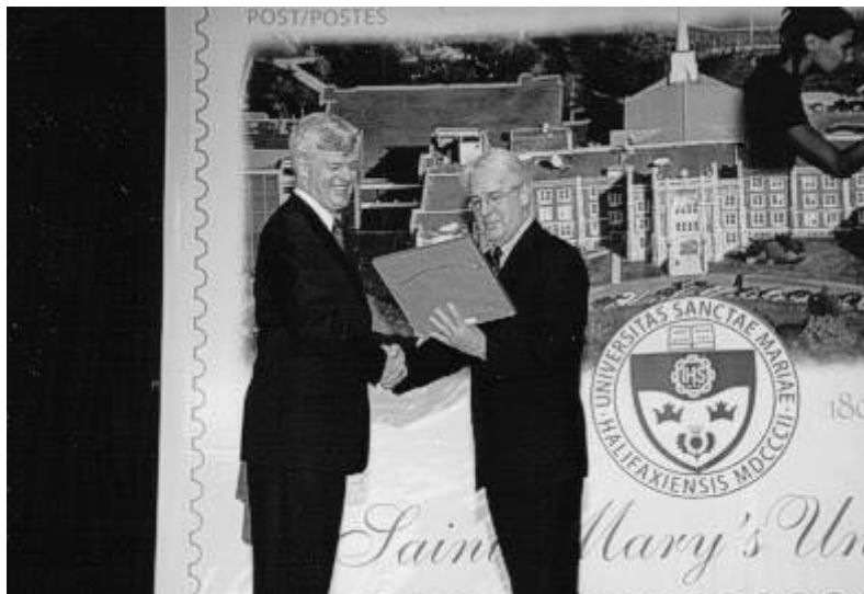
The Honourable, John Manley, Minister of Finance; and Senator Wilfred Moore, Member of the Board of Governors, at the official stamp launch, May 2002.

The thesis requires the student to apply the learning from all previous courses in the program to the situation of their home co-operative or credit union by proposing changes to any or all aspects of the organization so as to improve its operations and enhance its value to its members.governance issues, planning processes, and approaches to strategy.