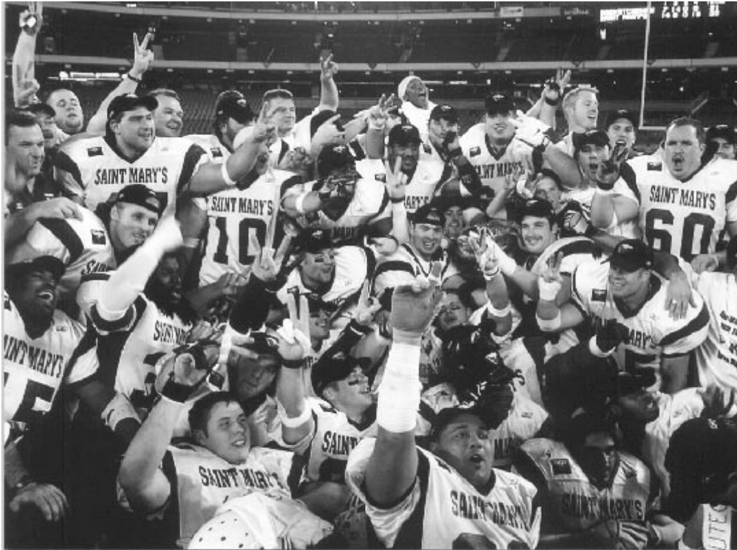
How sweet it is! Football Huskies win their second Vanier Cup in two years.