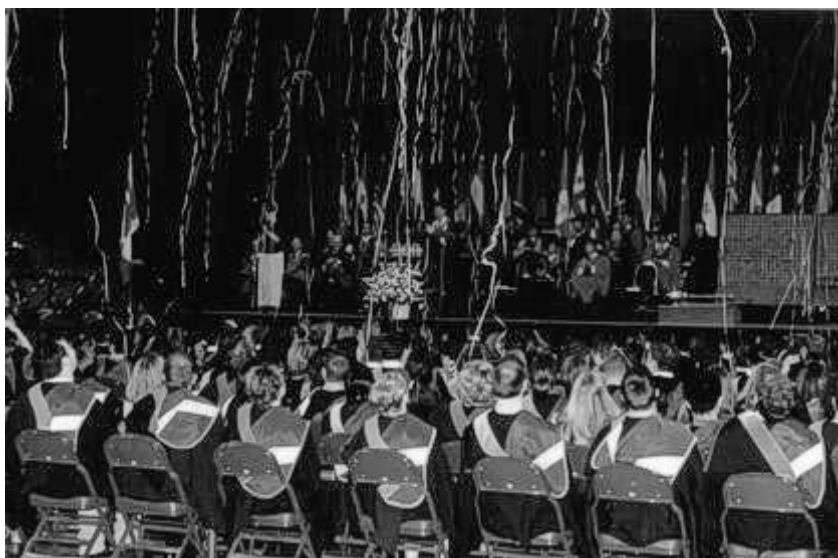
May 2002 Spring Convocations, celebrating the University's 200th Anniversary.