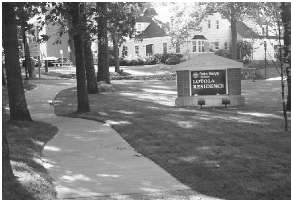
Gorsebrook Avenue entrance to the Loyola Residence

It is the responsibility of all members of the University community - students, faculty, administrators, and staff - carrying out research involving human subjects to seek approval from the University Research Ethics Board (REB) for their research. Student submissions to the REB should be made through the thesis supervisor. For further information, please consult the REB website: www.smu.ca/academic/reb .